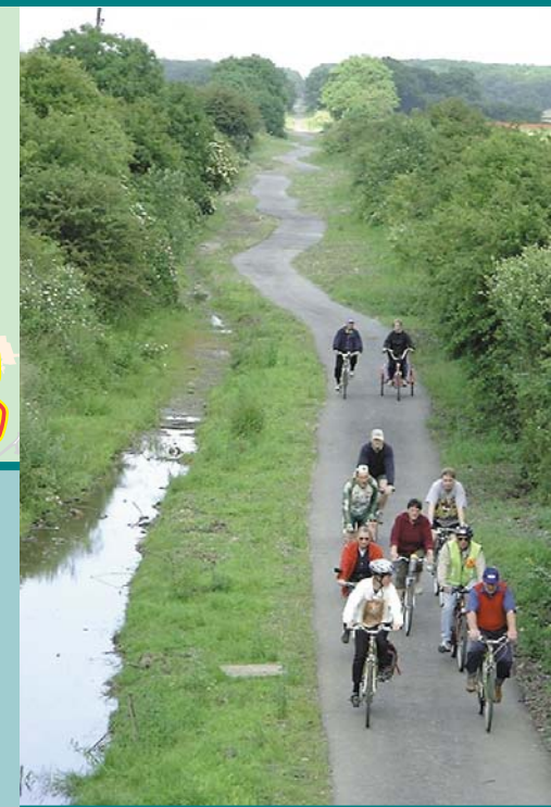
A six mile shared use path for the whole community